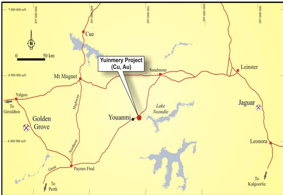
Yuinmery Project location map