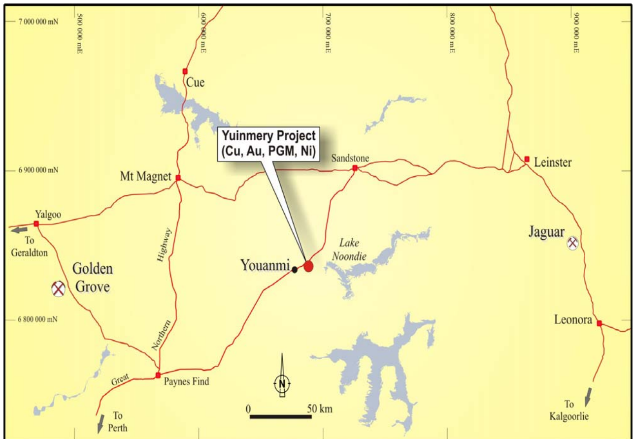
Figure 1 : Yuinmery Project location map