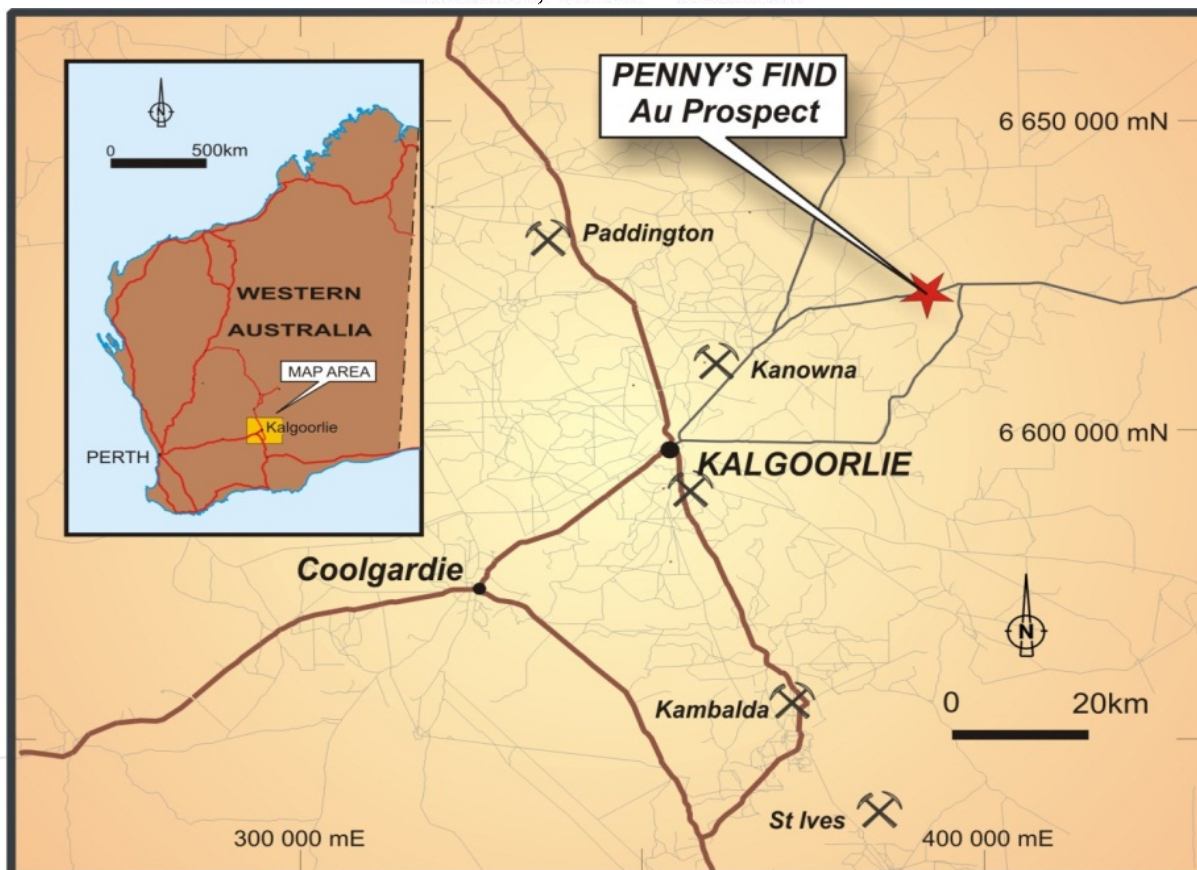
Figure 2 – Location Penny's Find deposit